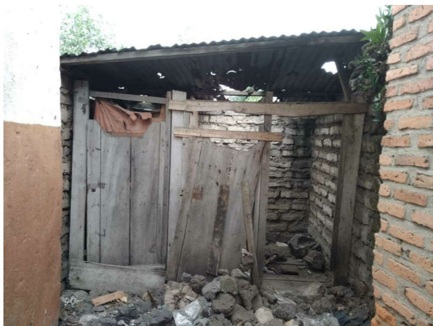
Photos de la situation existante de l' ecole EP MSAWATO